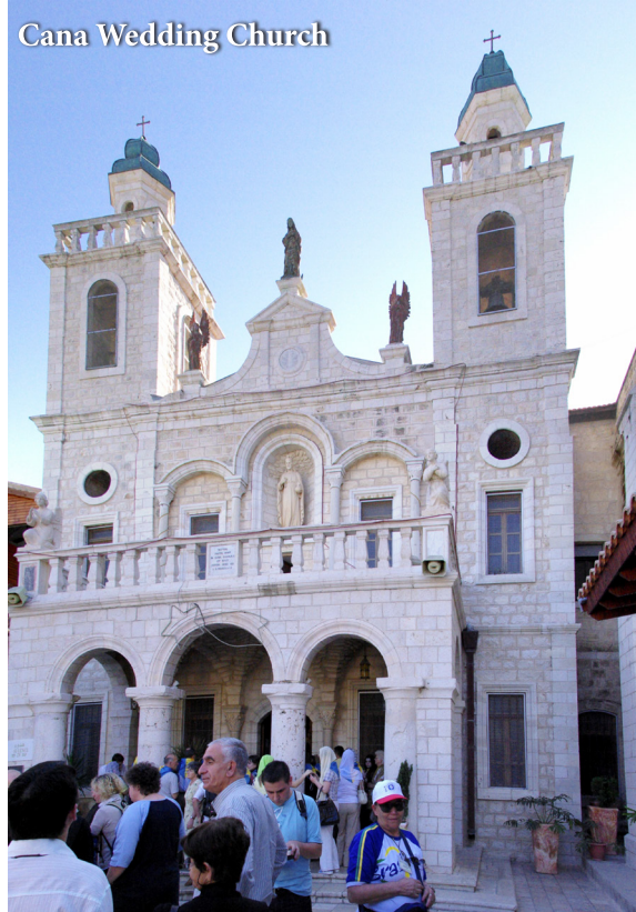
Cana Wedding Church

continue to Tel Megiddo, the site scholars have identified as the Valley of the Armageddon.